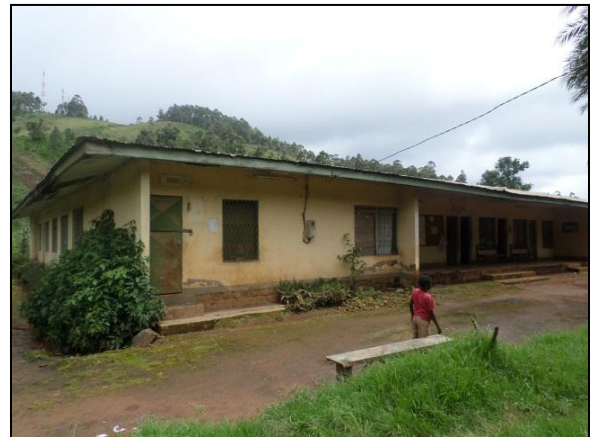
Two buildings inside the hospital Pinyin in Cameroon Africa

HCP members attended the PDO USA 2013 Annual Convention that took place in New Jersey as special guests. HCP was officially recognized for their assistance to the PDO community in Africa.