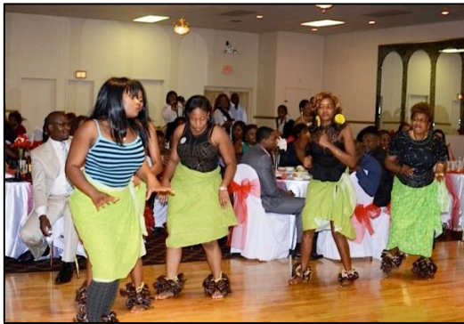
Cameroonian dancers performing one of their traditional dances