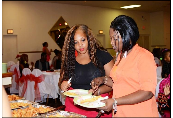
PDO Members of the Cameroonian Organization knew exactly where to go first to serve themselves